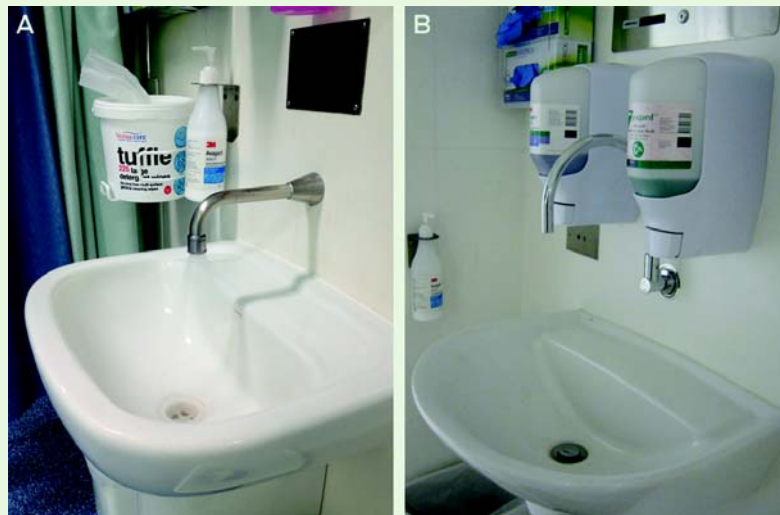
A: Existing sink, showing water spray directly over drain. B: Compliant sink design, showing larger basin and less forceful water flow directed away from drain, to prevent splash back and contamination with drain contents.